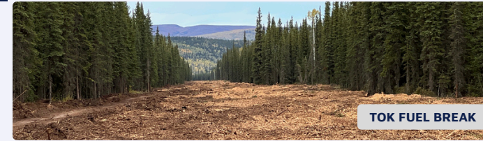
TOK FUEL BREAK

Resilient Landscapes and Fire Adapted Communities.